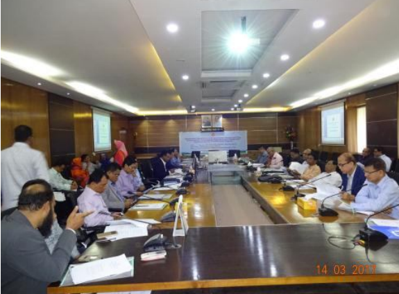
Figure A1: Consultation workshop organized by MOHFW on 14 March, 2017

A general introduction and salient features of the Environmental Management Plan was presented through PowerPoint slides. Various limitations of the MWM system in Bangladesh, with particular emphasis in the Sylhet and Chittagong Divisions were discussed. The participants in general agreed that healthcare waste management should be given more priority by the concerned authorities involved. A summary of their feedback and response from the PMU team is given below: